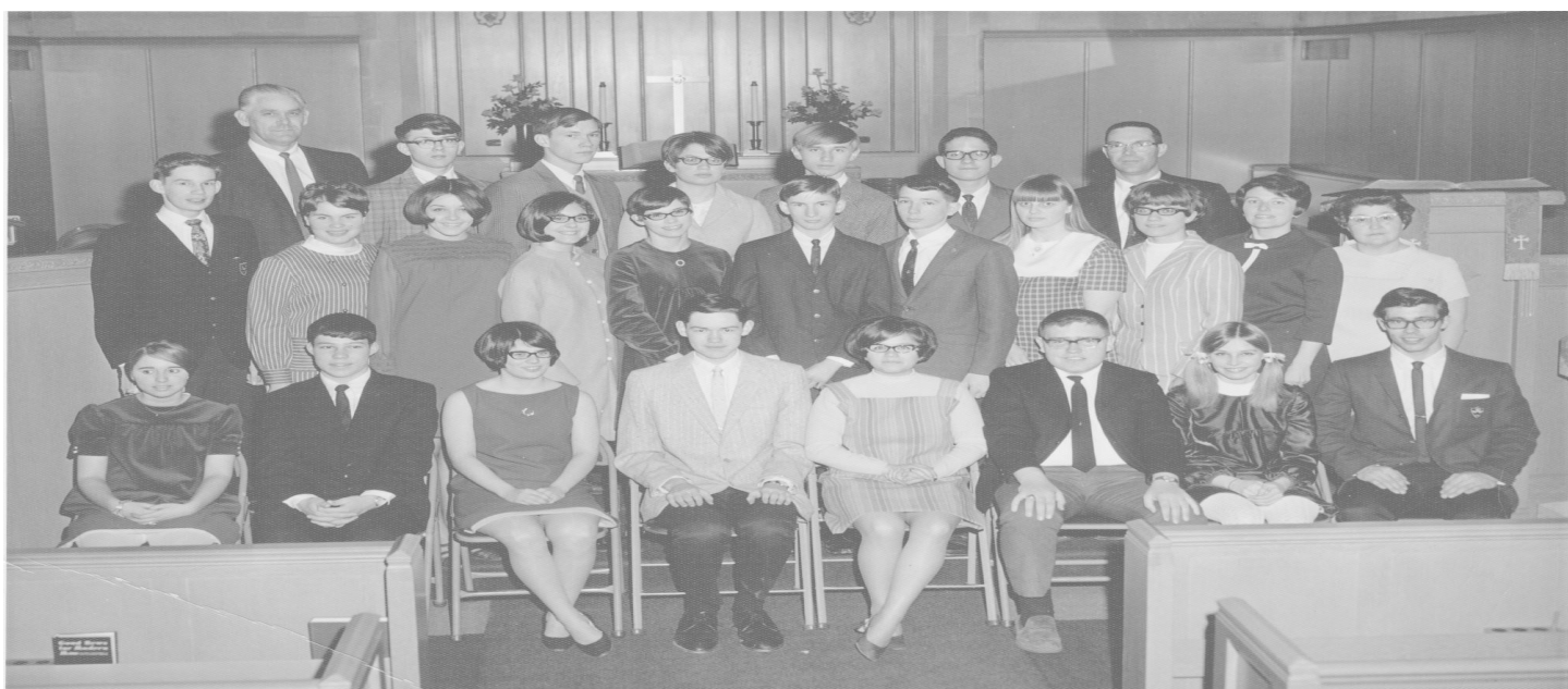
Pilgrim Fellowship...back in the day. Recognize any of these fine folks?